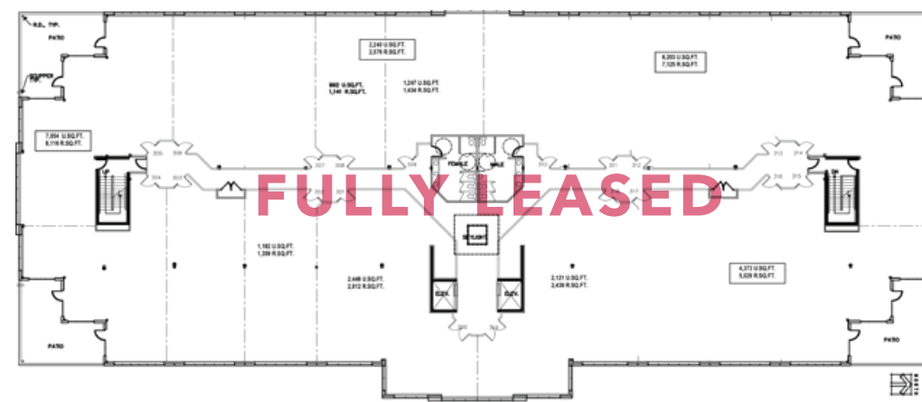
9525-201 STREET 3RD FLOOR