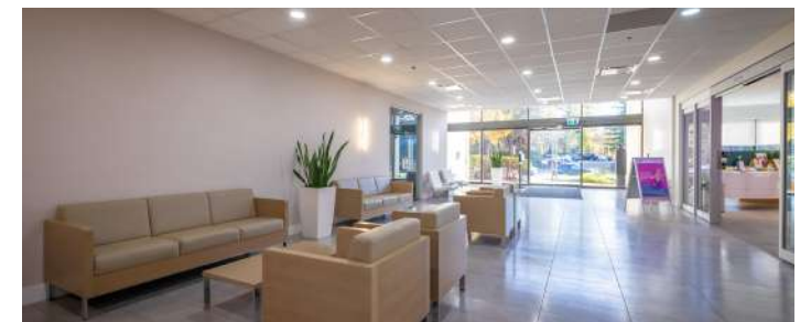
3185 Willingdon Green