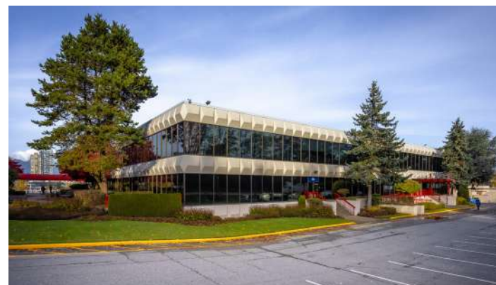
4299 Canada Way