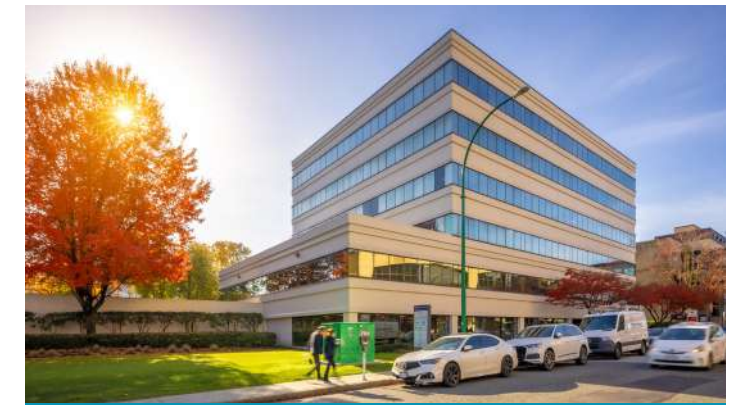
4370 Dominion Street

Random Underground Gated $110 Reserved Surface $280