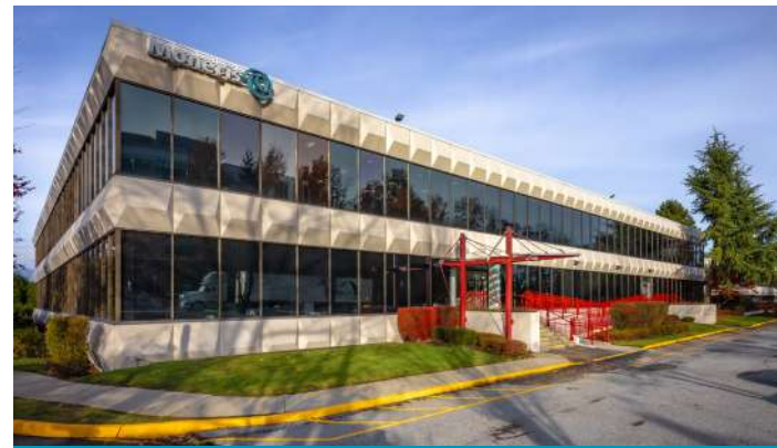
4259 Canada Way

Random Underground Gated $110 Reserved Surface $280