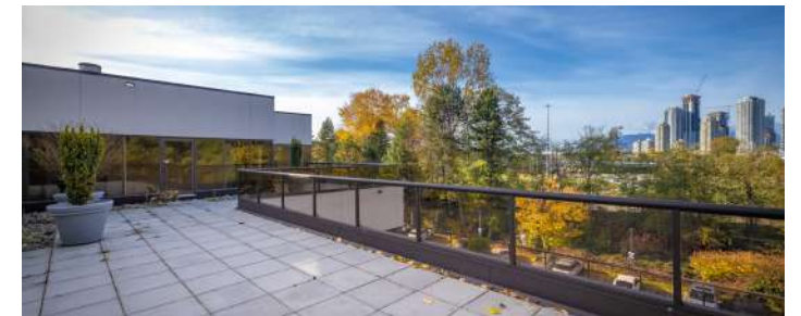
Unit 304 Balcony | 3185 Willingdon Green