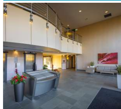
4400 Dominion Street