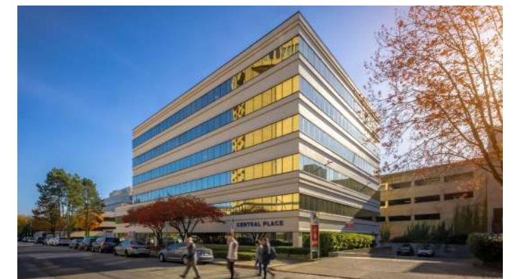
4370 Dominion Street