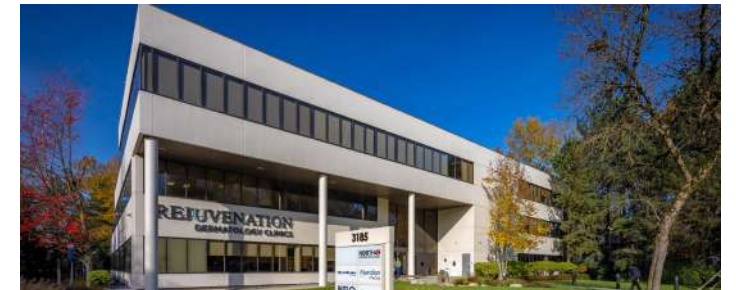
3185 Willingdon Green