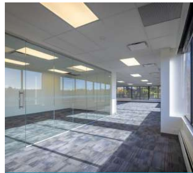
Unit 440 4400 Dominion Street