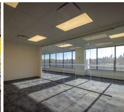
Unit 440 4400 Dominion Street