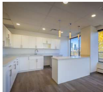
Unit 440 Kitchen 4400 Dominion Street