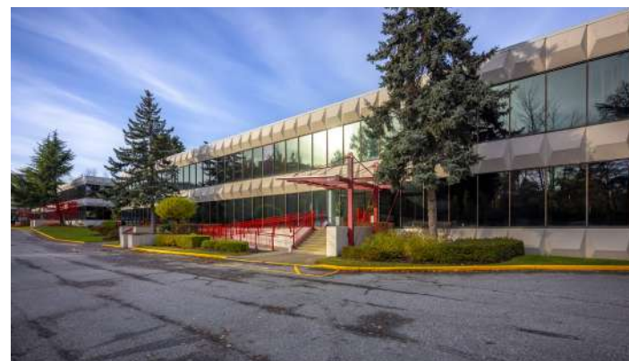
4299 Canada Way