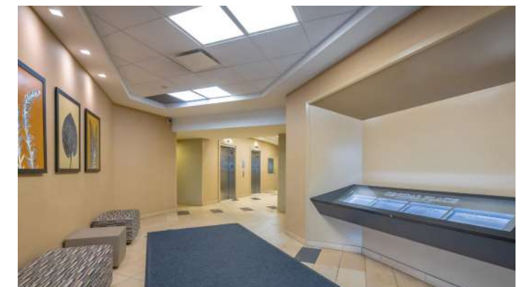
4370 Dominion Main Lobby