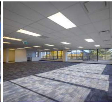
Unit 440 4400 Dominion Street