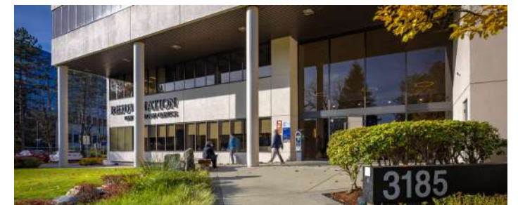
3185 Willingdon Green