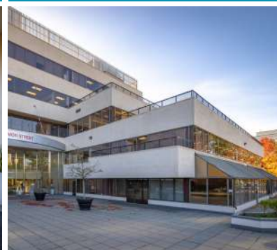
4400 Dominion Street