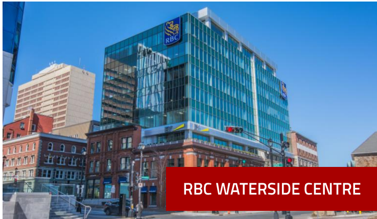
RBC WATERSIDE CENTRE