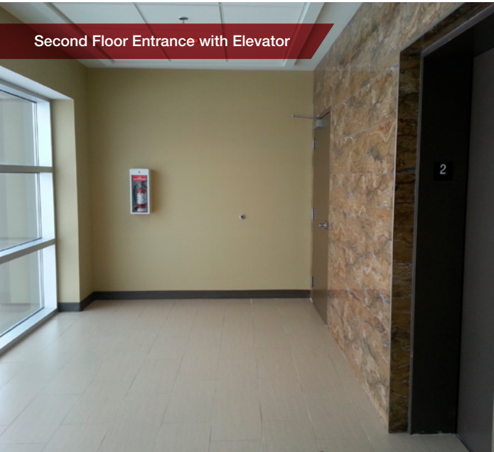
Second Floor Entrance with Elevator

2nd Floor Office Fully Developed (Warehouse is undeveloped)