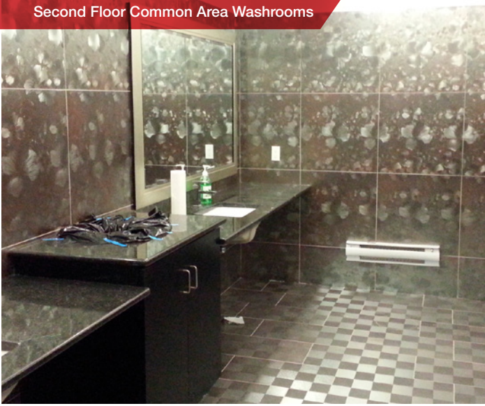
Second Floor Common Area Washrooms

For Lease Nerval on Roper Road Office/Warehouse