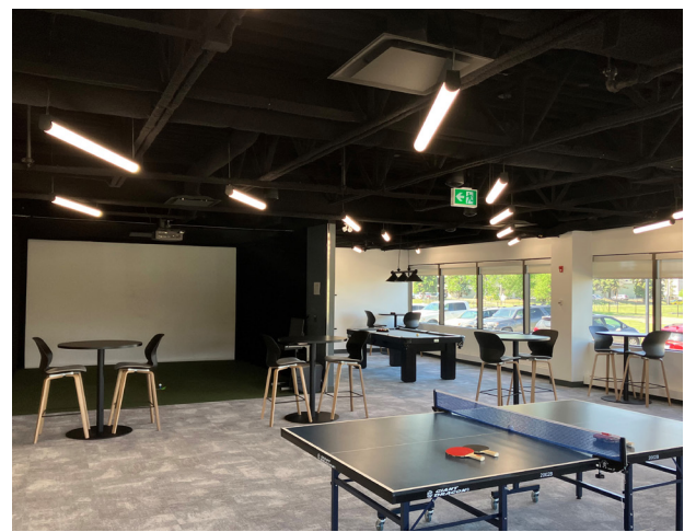
Fitness Facility (Building B)