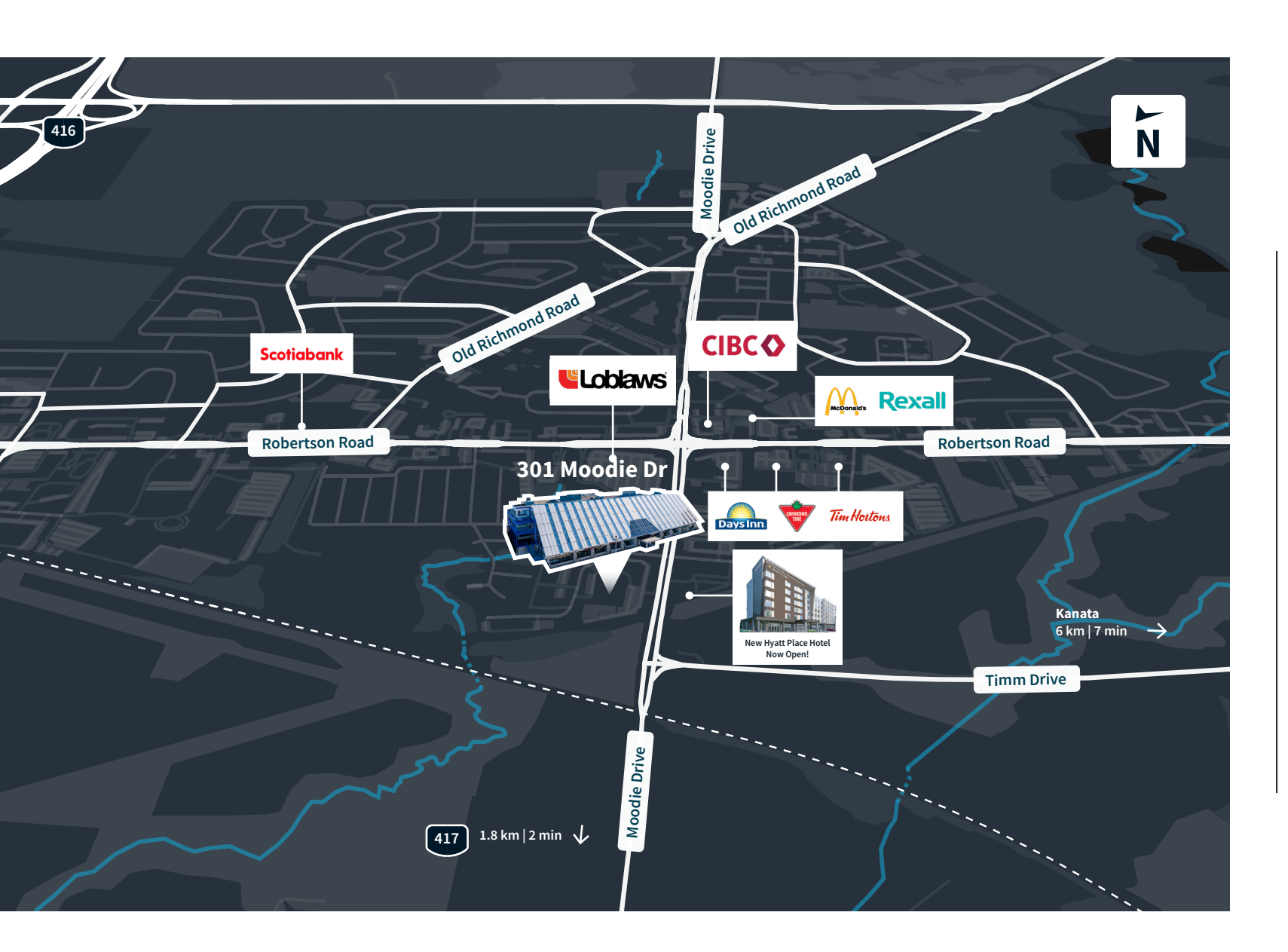
301 Moodie Drive is situated between Highway 416 on the east and the Highway 417 to the north, excellent bus service connecting to Bayshore Shopping Centre, Kanata, and Downtown.