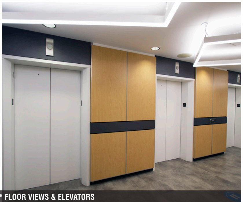
27 TH / 28 TH FLOOR VIEWS & ELEVATORS