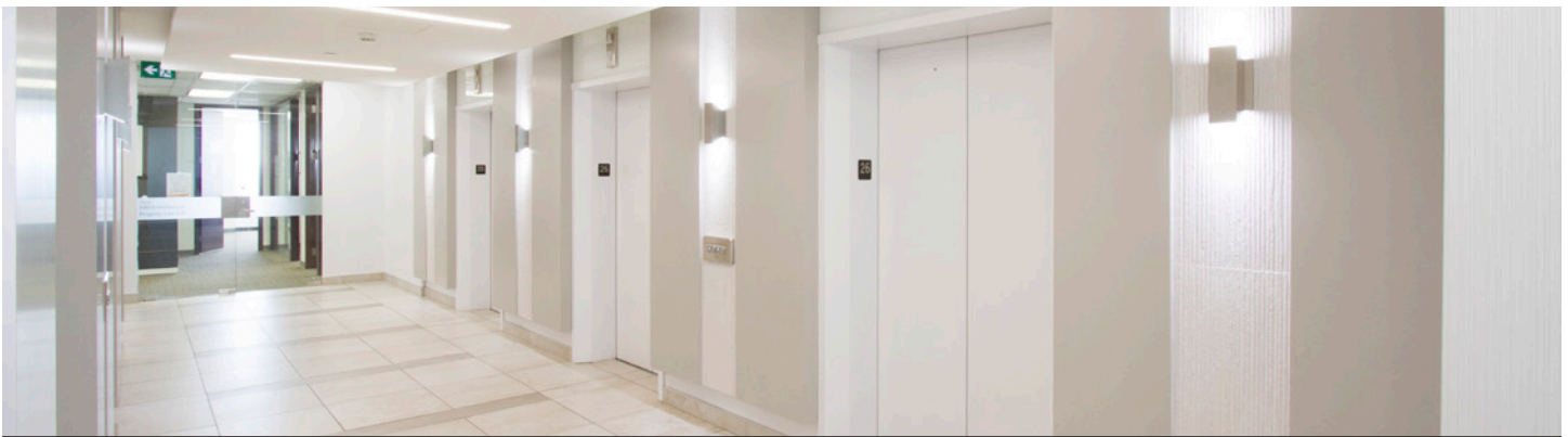
BUILDING STANDARD ELEVATOR LOBBY