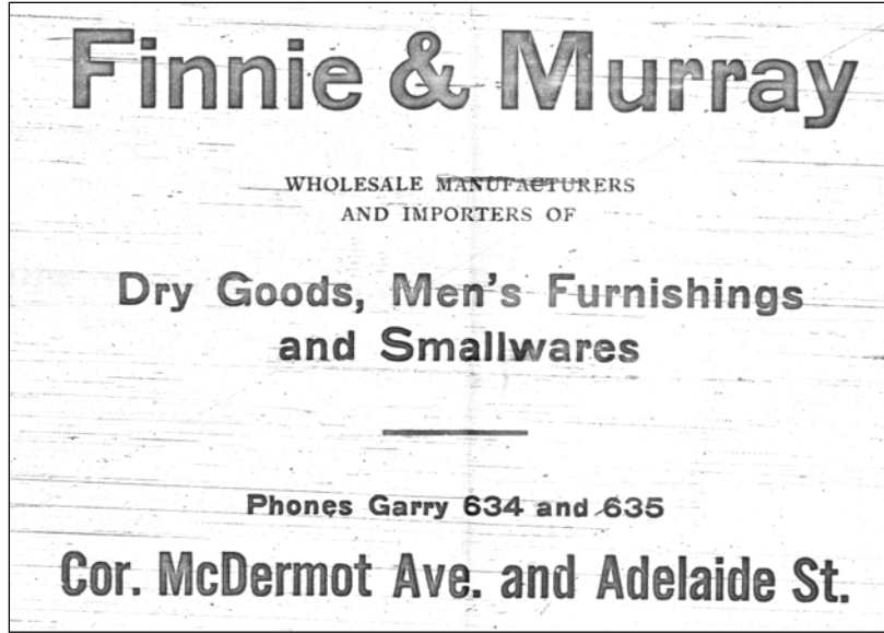
Plate 3 – Advertisement, Henderson's Directory , 1915, p. 104.