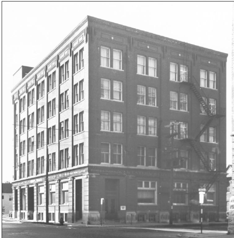
Plate 4 - Western Glove Building, 321 McDermot Avenue, 1970.