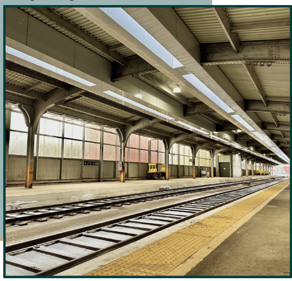
Train boarding platform