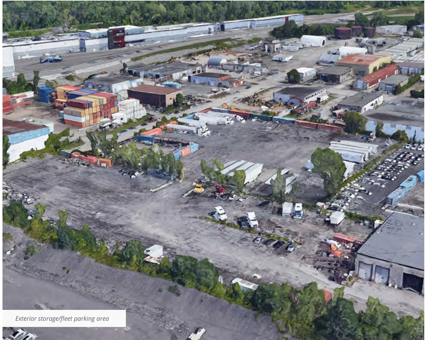
Exterior storage/fleet parking area