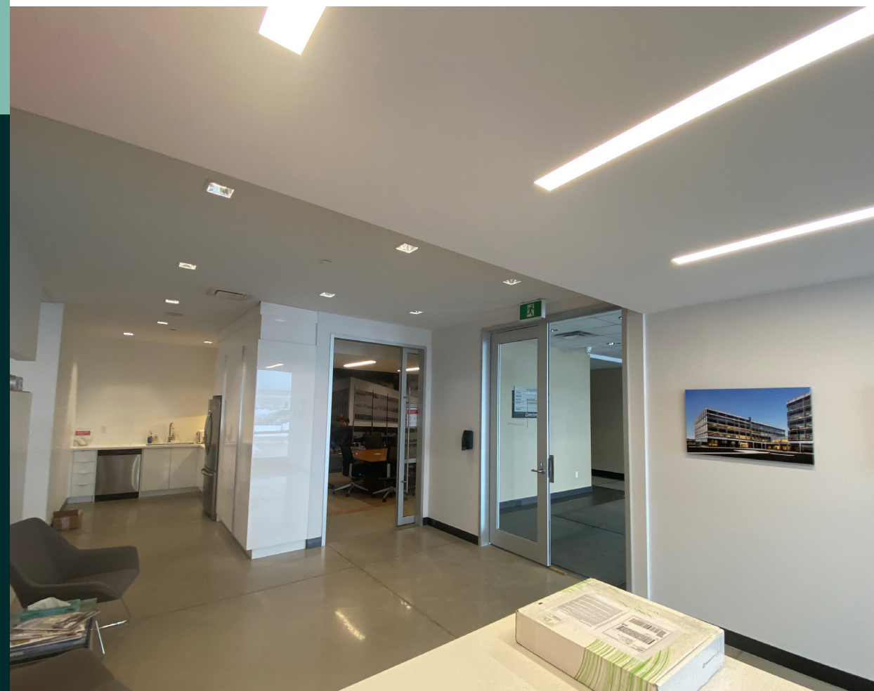
Suite 103 - Reception Area