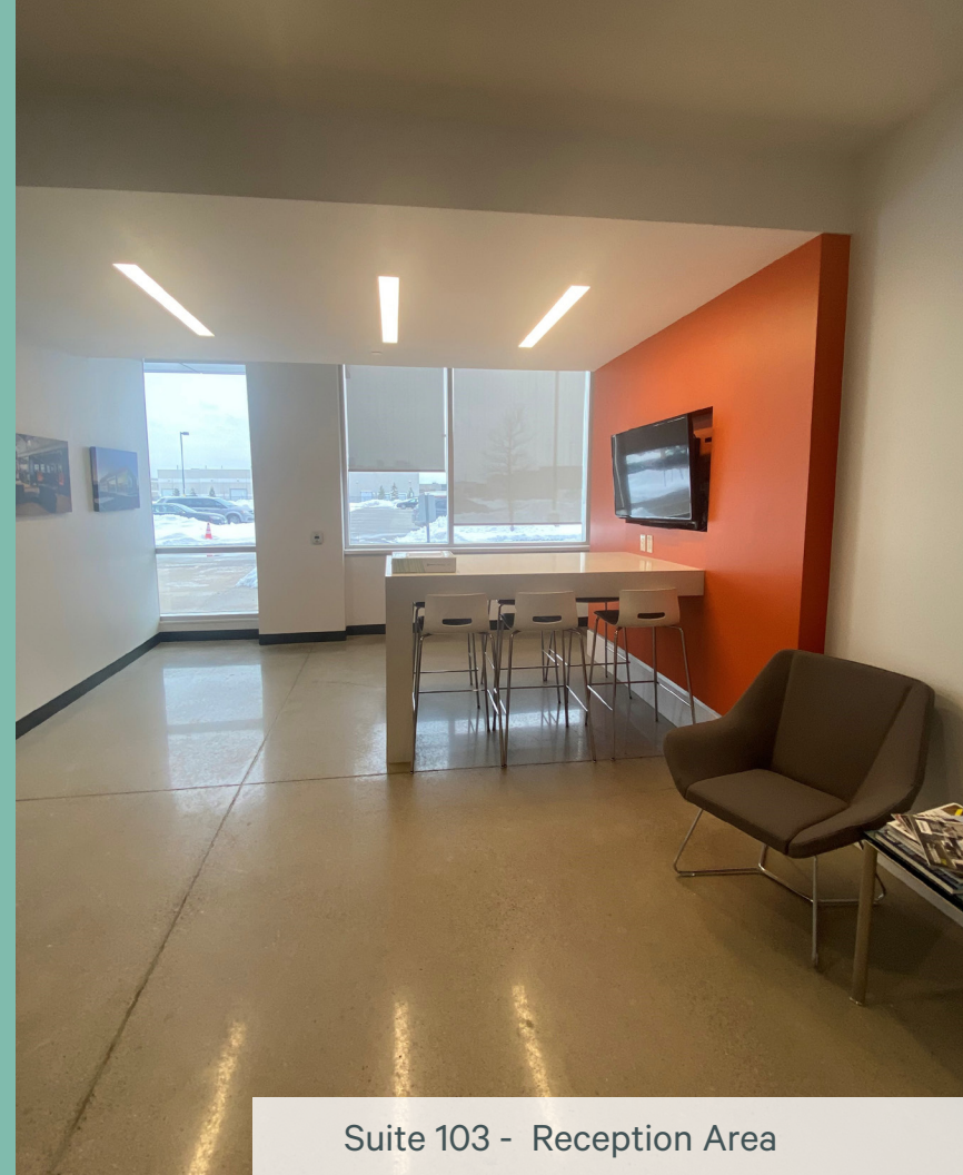
Suite 103 - Reception Area