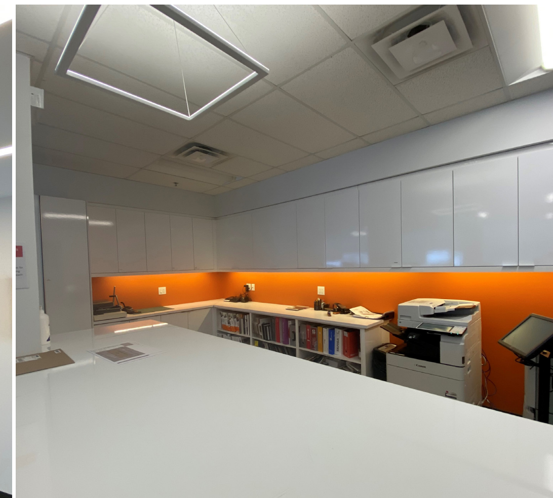
Suite 103 - Filing Area & Storage