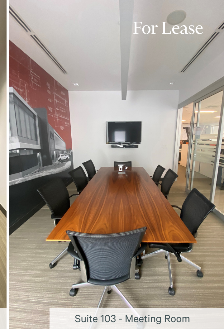
Suite 103 - Meeting Room