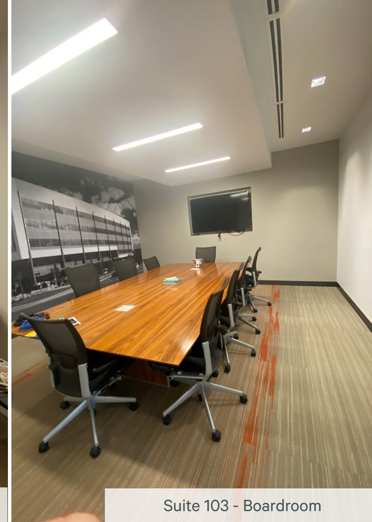
Suite 103 - Boardroom