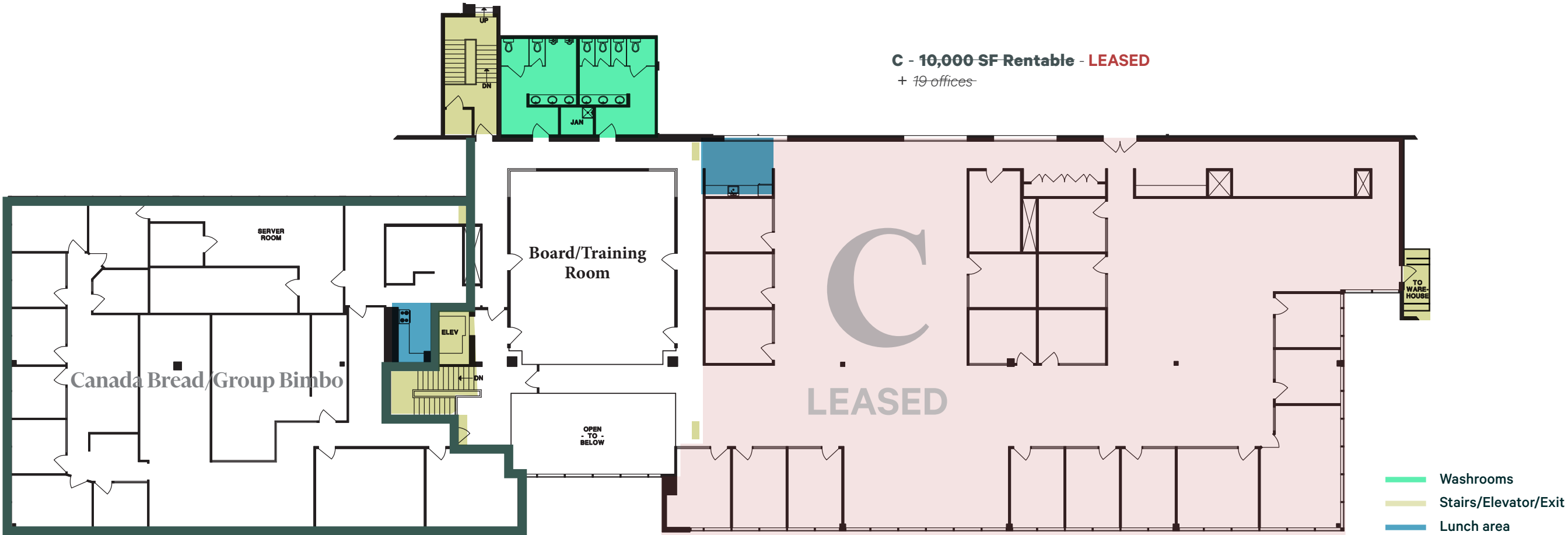
Floor Plan Not to Scale