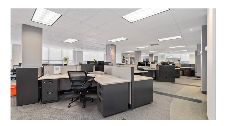
(Approximately, not to scale)