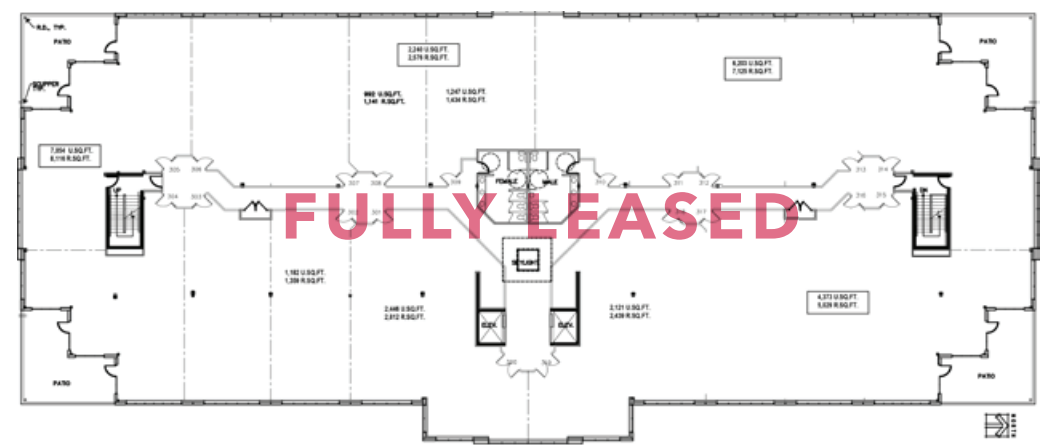
9525-201 STREET 3RD FLOOR