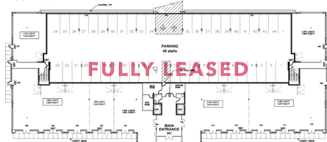
9525-201 STREET GROUND FLOOR