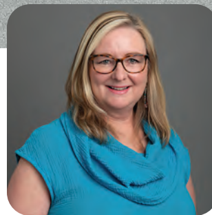
DIRECTOR OF REAL ESTATE

This 2,302 sq. ft. unit of second floor office space has a reception area, kitchen, multiple offices and an open work area. Join other professional office users in this fully renovated, multi-use building in the center of Langley's shopping district!