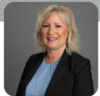
PROPERTY MANAGER & LEASING AGENT