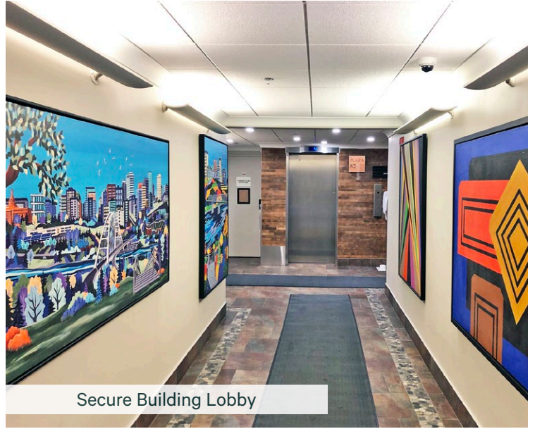
Secure Building Lobby