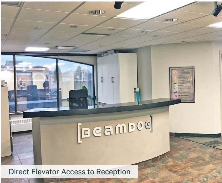
Direct Elevator Access to Reception