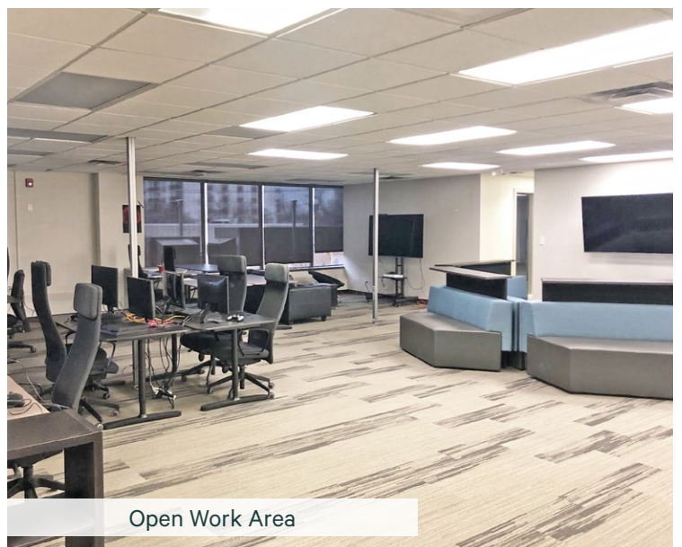
Open Work Area