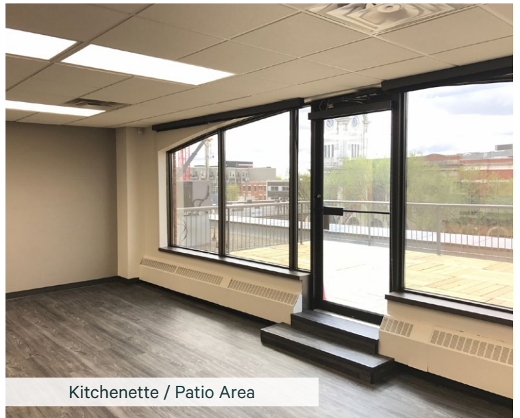
Kitchenette / Patio Area