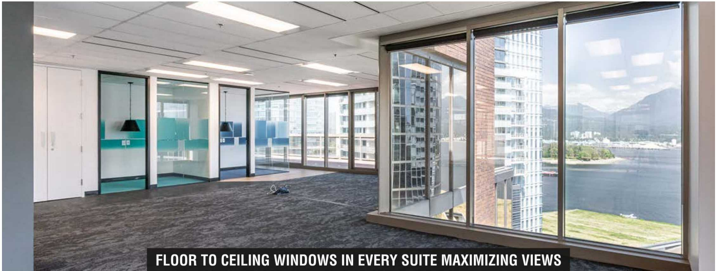
FLOOR TO CEILING WINDOWS IN EVERY SUITE MAXIMIZING VIEWS