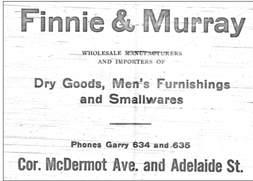
Plate 3 – Advertisement, Henderson's Directory , 1915, p. 104.