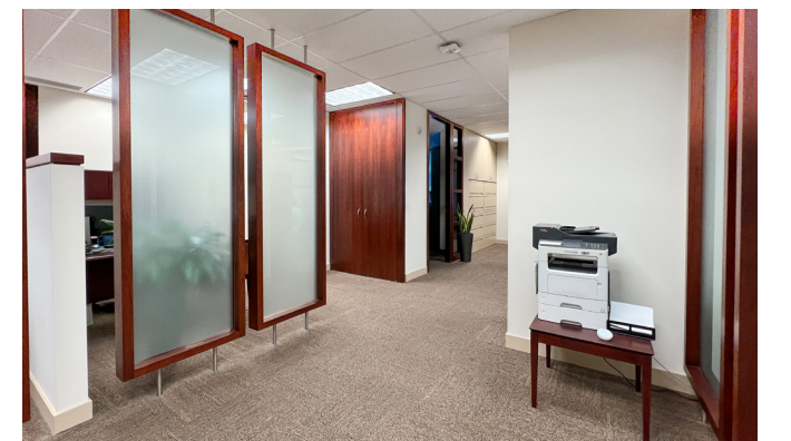
*Unit 500 pictured above