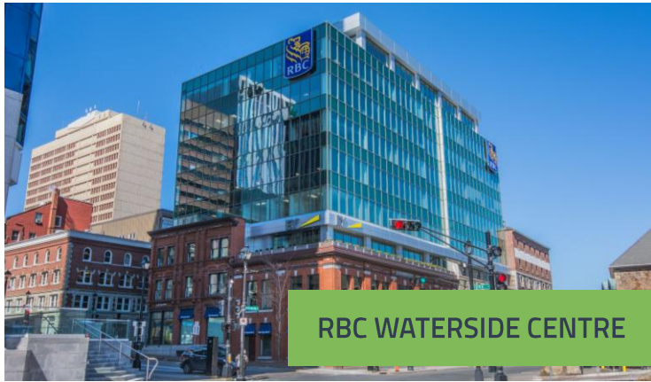
RBC WATERSIDE CENTRE