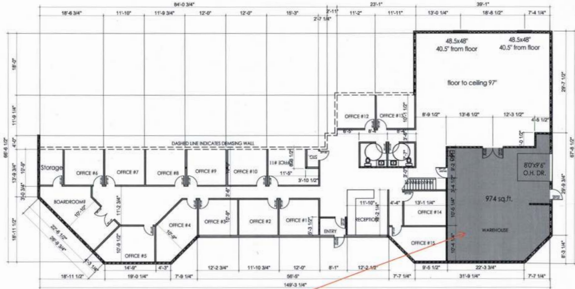
OFFICE RENOVATION - OPTION A WEST BAY 17589 108 AVENUE, EDMONTON AB SCALE: 3/16" = 1'-0"