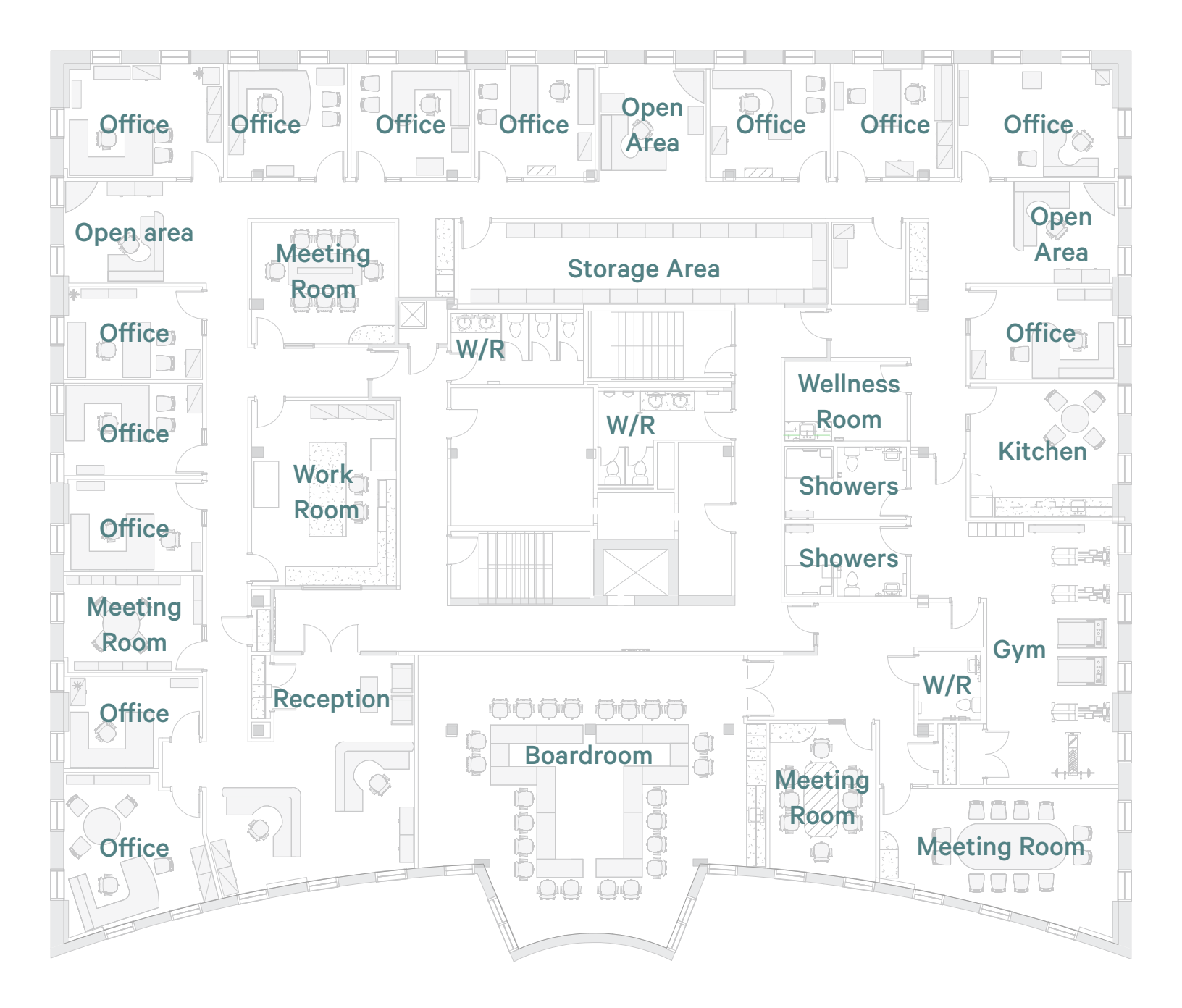
3<sup>rd</sup> Floor 9,972 sq. ft.