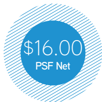
Asking Lease Rate