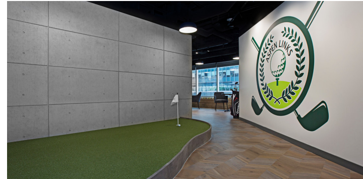
ASPEN LINKS GOLF LOUNGE