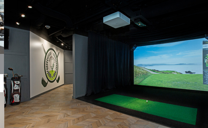
ASPEN LINKS GOLF SIMULATOR