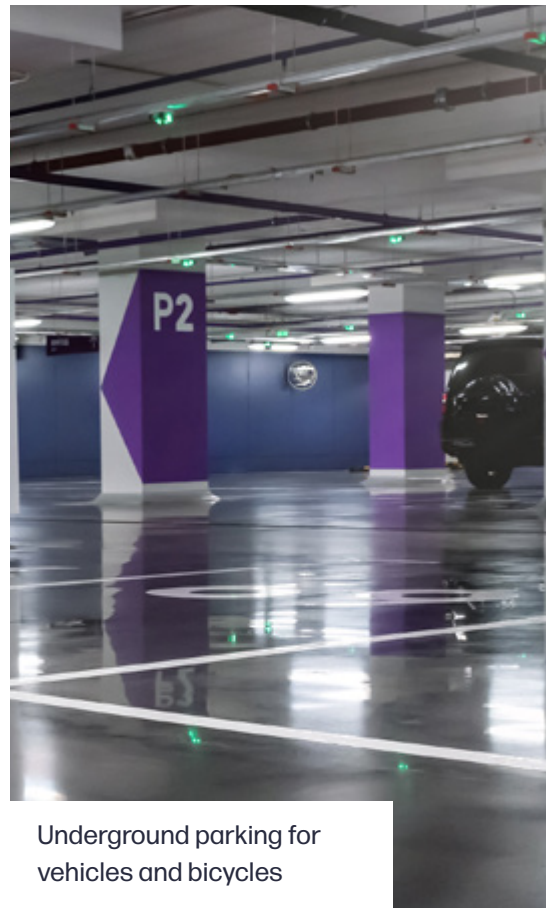
Underground parking for vehicles and bicycles