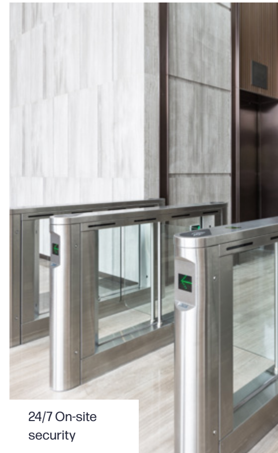
24/7 On-site security