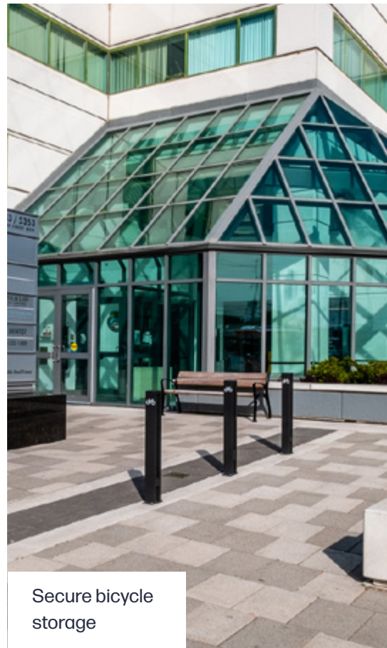
Secure bicycle storage