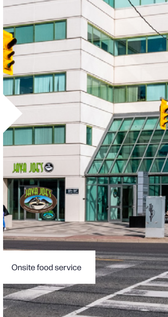
Onsite food service