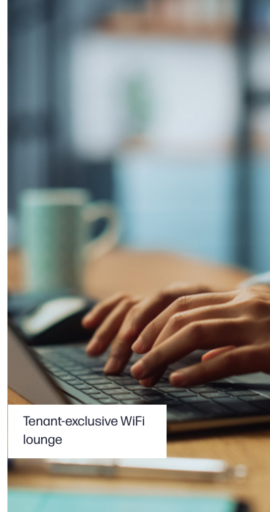
Tenant-exclusive WiFi lounge