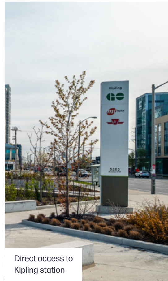
Direct access to Kipling station