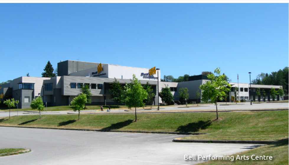
Bell Performing Arts Centre