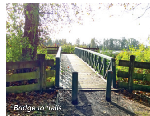
Bridge to trails

Tenant improvement allowance available (O.A.C.)