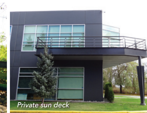
Private sun deck