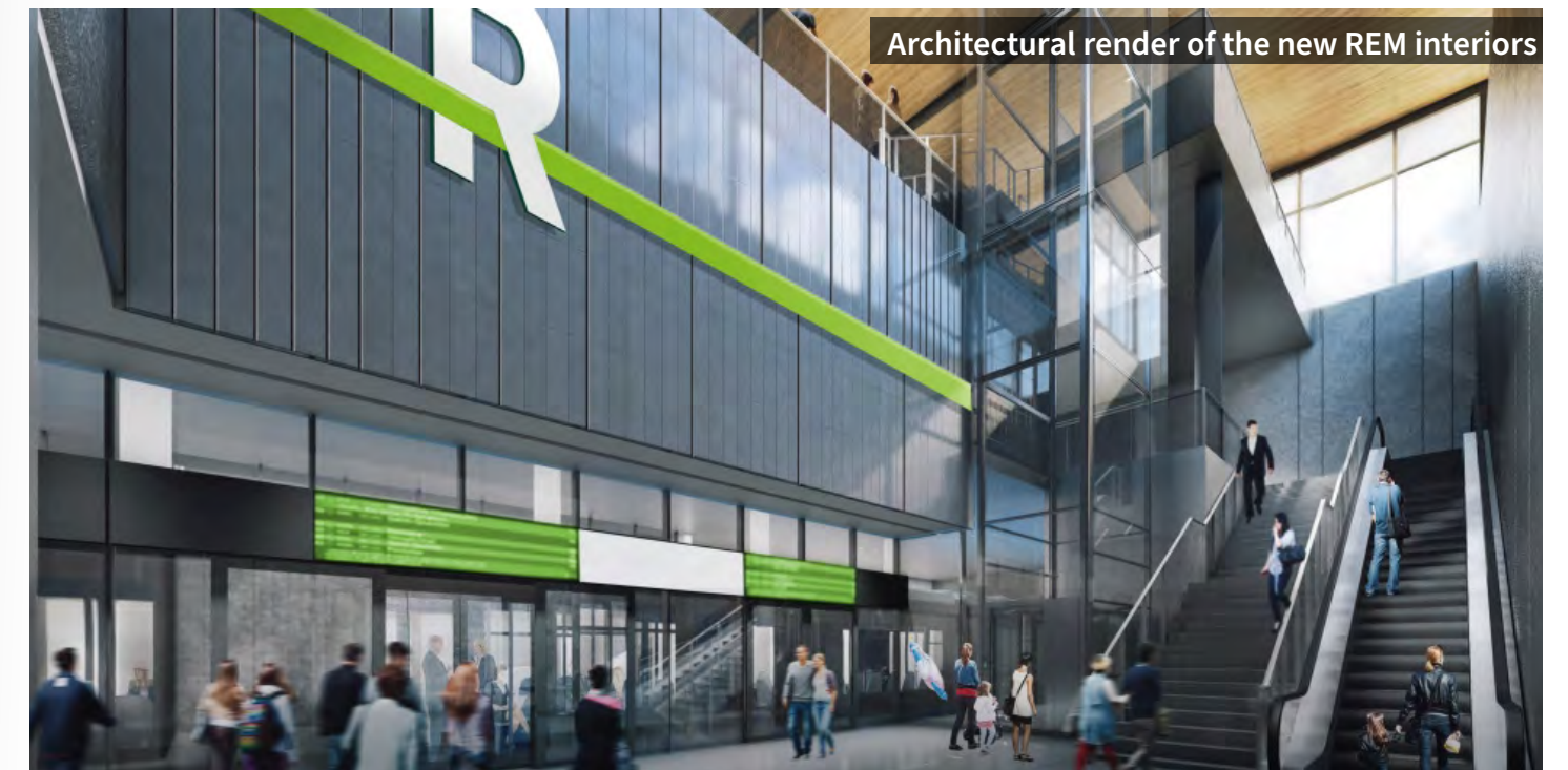
1 REM_Station_interieur. Retrieved from https://rem.info/en