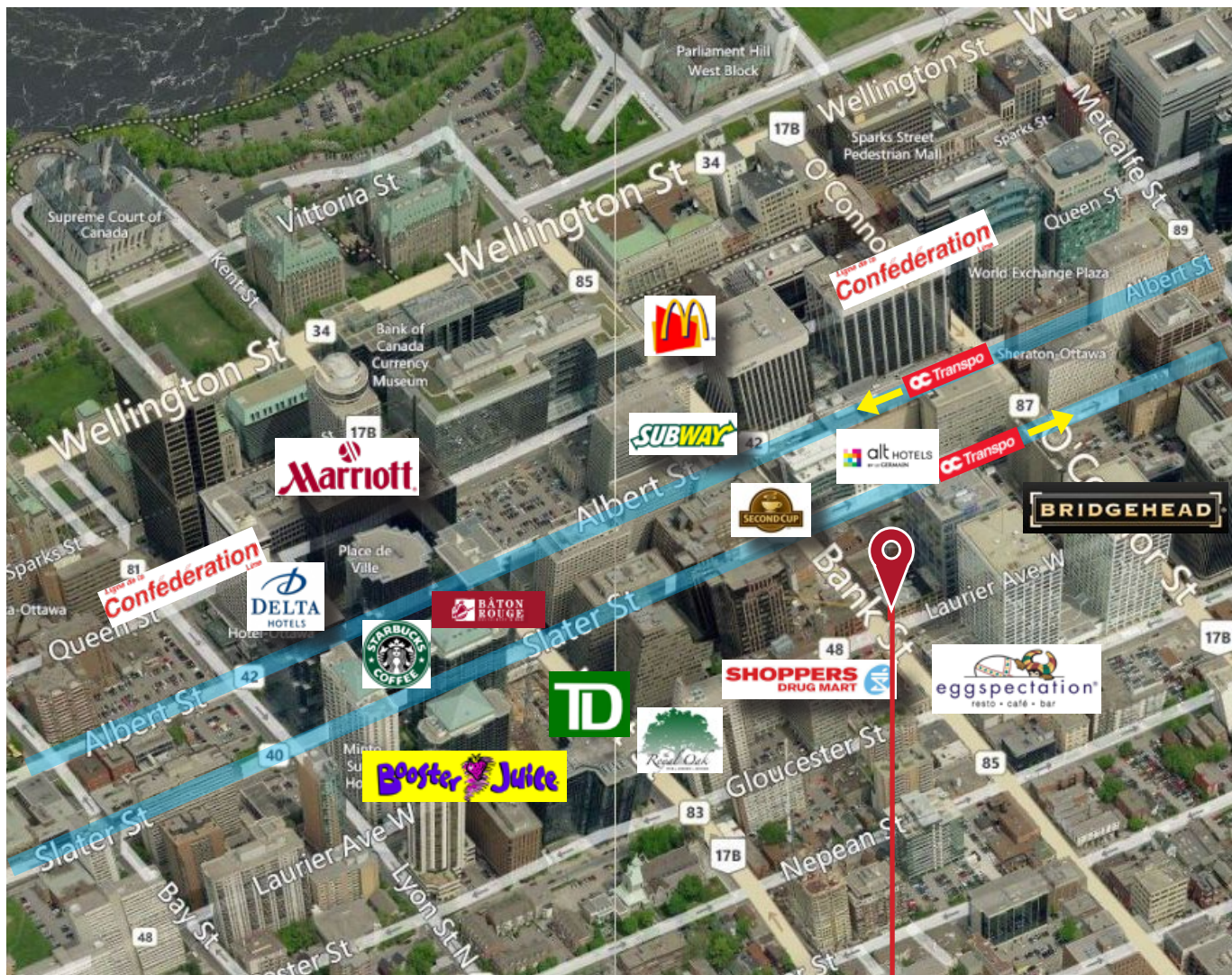
279 Laurier Ave.