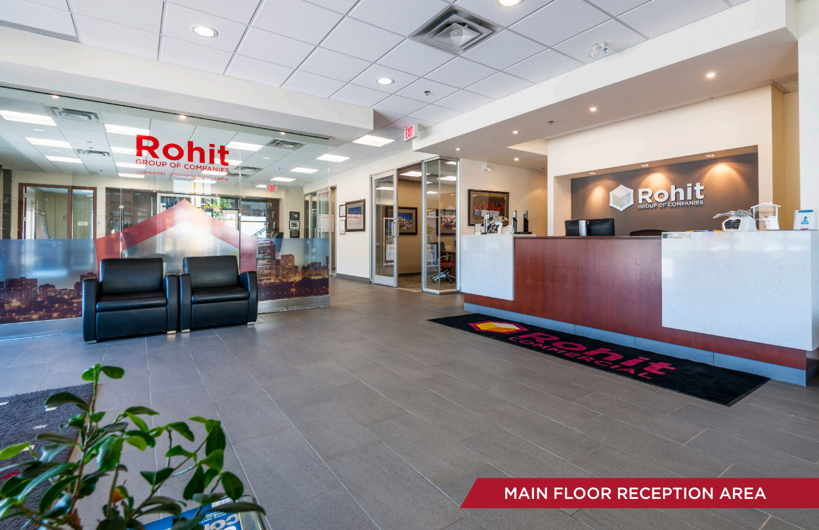
MAIN FLOOR RECEPTION AREA