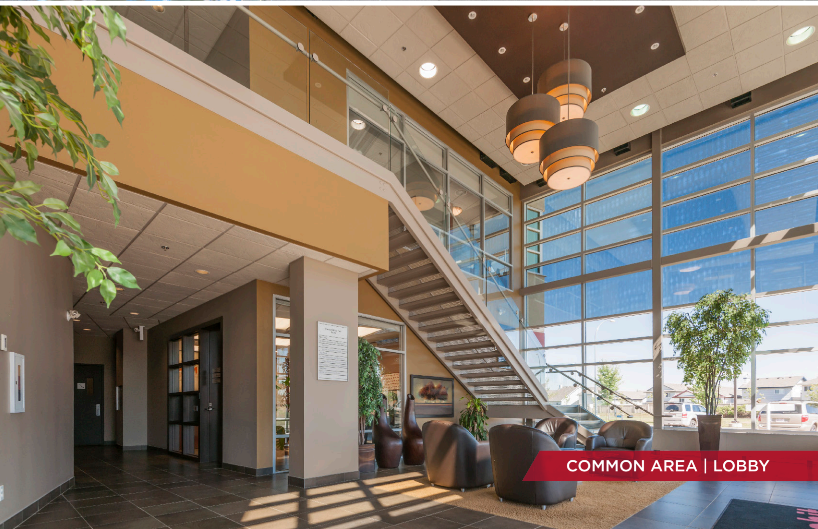
COMMON AREA | LOBBY