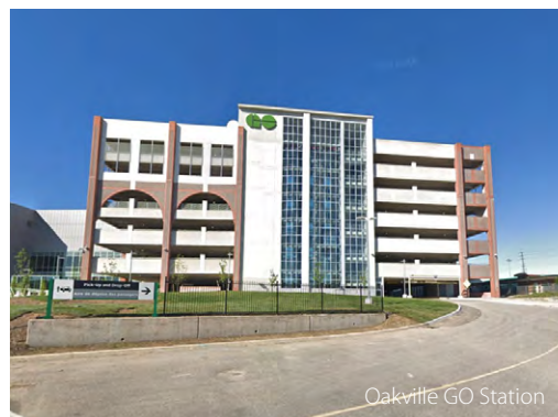
Oakville GO Station