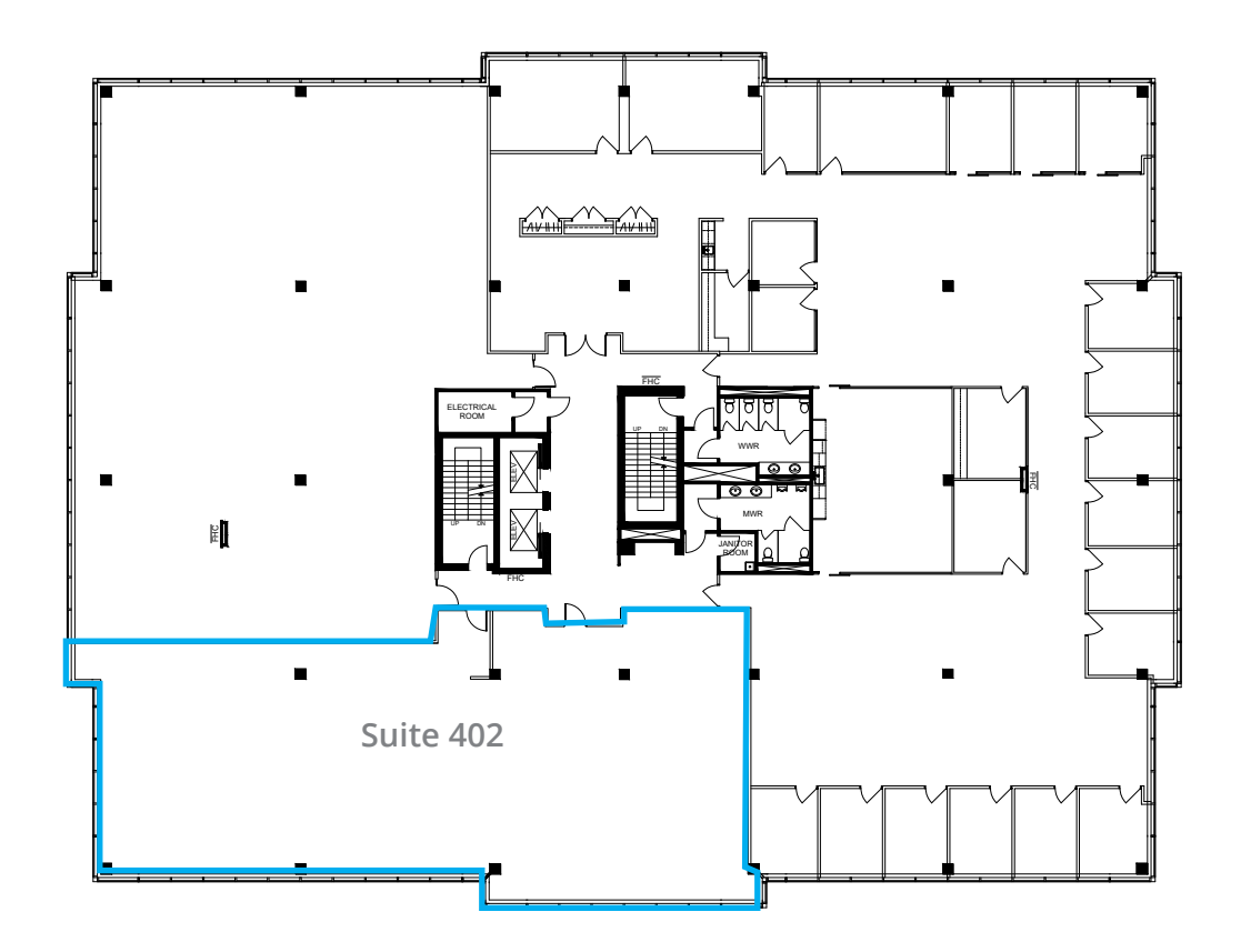
Suite 402 4,800 SF