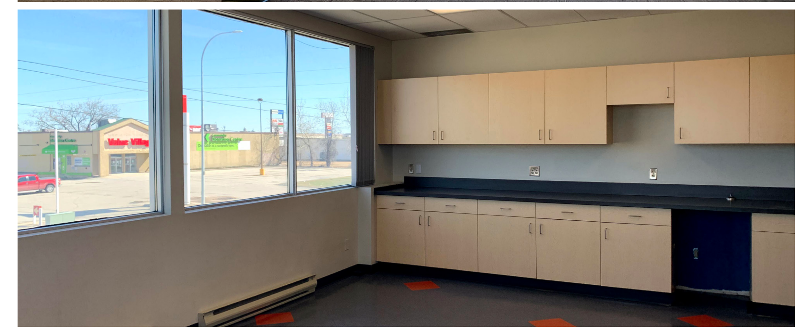
Independently\ Owned\ and\ Operated\ /\ A\ Member\ of\ the\ Cushman\ \&\ Wakefield\ Alliance

©2020 Cushman & Wakefield. All rights reserved. The information contained in this communication is strictly confidential. This information has been obtained from sources believed to be reliable but has not been verified. NO WARRANTY OR REPRESENTATION, EXPRESS OR IMPLIED, IS MADE AS TO THE CONDITION OF THE PROPERTY (OR PROPERTIES) REFERENCED HEREIN OR AS TO THE ACCURACY OR COMPLETENESS OF THE INFORMATION CONTAINED HEREIN, AND SAME IS SUBMITTED SUBJECT TO ERRORS, OMISSIONS, CHANGE OF PRICE, RENTAL OR OTHER CONDITIONS, WITHDRAWAL WITHOUT NOTICE, AND TO ANY SPECIAL LISTING CONDITIONS IMPOSED BY THE PROPERTY OWNER(S). ANY PROJECTIONS, OPINIONS OR ESTIMATES ARE SUBJECT TO UNCERTAINTY AND DO NOT SIGNIFY CURRENT OR FUTURE PROPERTY PERFORMANCE.