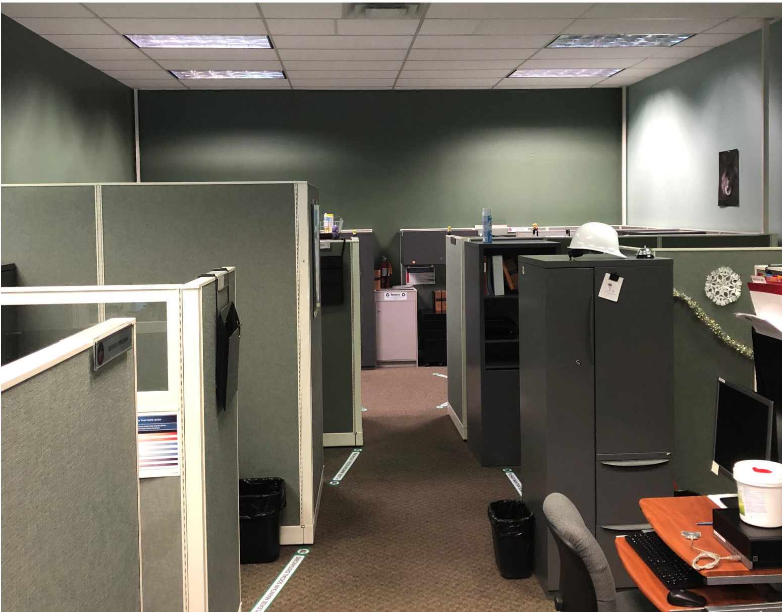
Independently\ Owned\ and\ Operated/A\ Member\ of\ the\ Cushman\ \&\ Wakefield\ Alliance

©2020 Cushman & Wakefield. All rights reserved. The information contained in this communication is strictly confidential. This information has been obtained from sources believed to be reliable but has not been verified. NO WARRANTY OR REPRESENTATION, EXPRESS OR IMPLIED, IS MADE AS TO THE CONDITION OF THE PROPERTY (OR PROPERTIES) REFERENCED HEREIN OR AS TO THE ACCURACY OR COMPLETENESS OF THE INFORMATION CONTAINED HEREIN, AND SAME IS SUBMITTED SUBJECT TO ERRORS, OMISSIONS, CHANGE OF PRICE, RENTAL OR OTHER CONDITIONS, WITHDRAWAL WITHOUT NOTICE, AND TO ANY SPECIAL LISTING CONDITIONS IMPOSED BY THE PROPERTY OWNER(S). ANY PROJECTIONS, OPINIONS OR ESTIMATES ARE SUBJECT TO UNCERTAINTY AND DO NOT SIGNIFY CURRENT OR FUTURE PROPERTY PERFORMANCE.