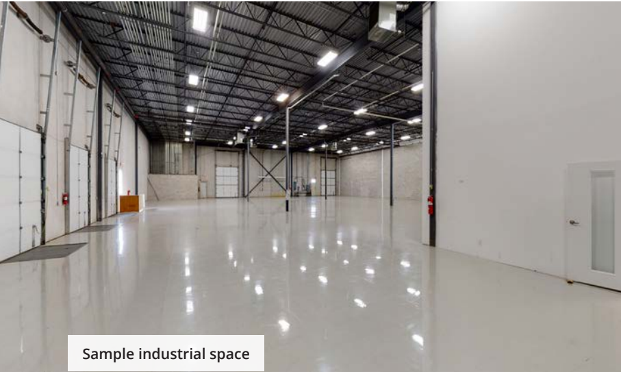
Sample industrial space