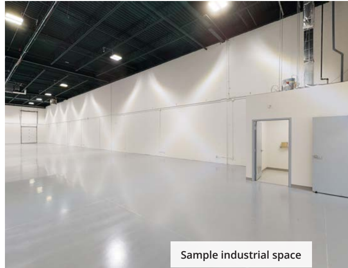
Sample industrial space