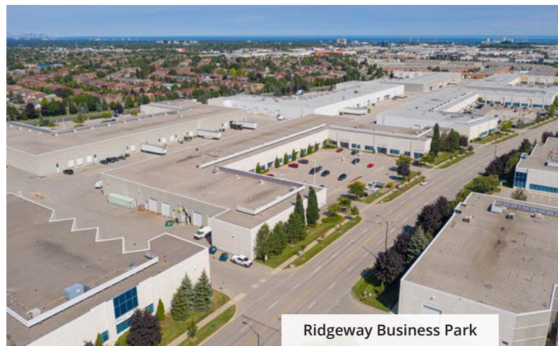
Ridgeway Business Park