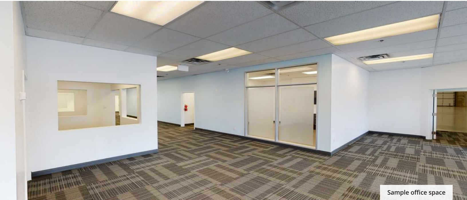
Sample office space