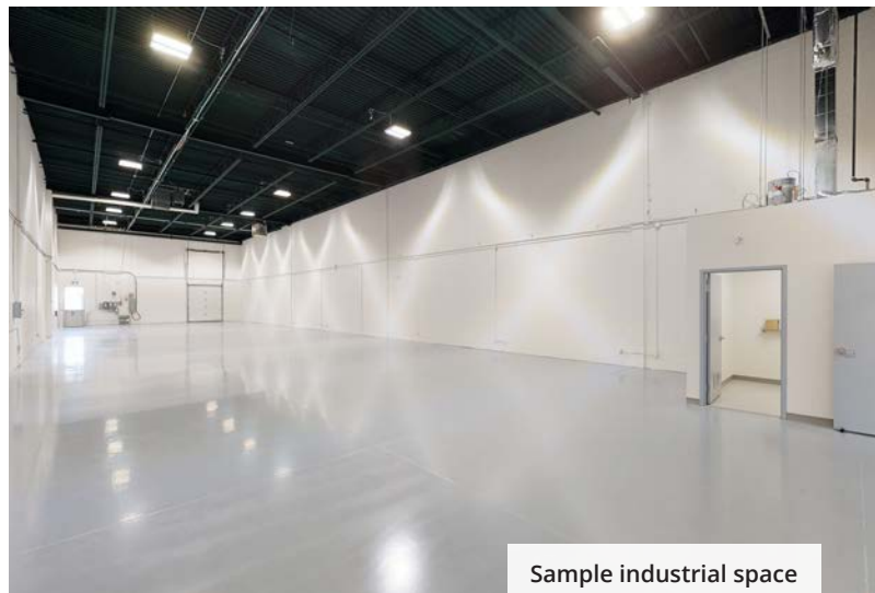
Sample industrial space