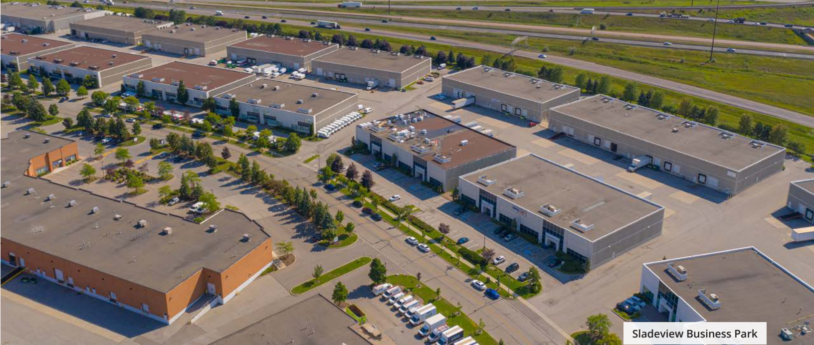
Sladeview Business Park