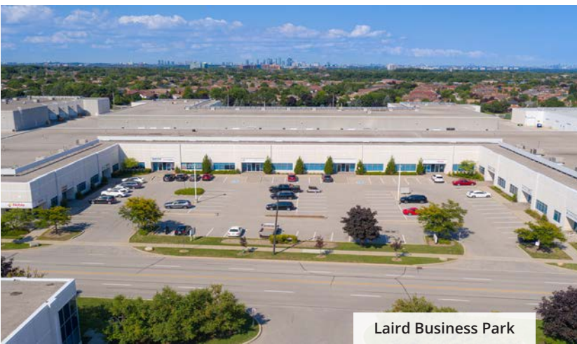
Laird Business Park