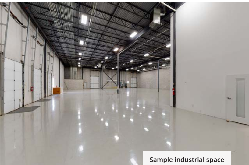
Sample industrial space