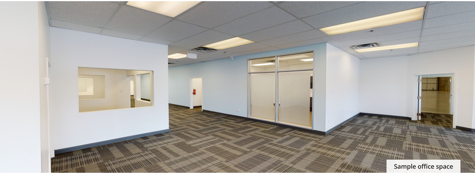
Sample office space