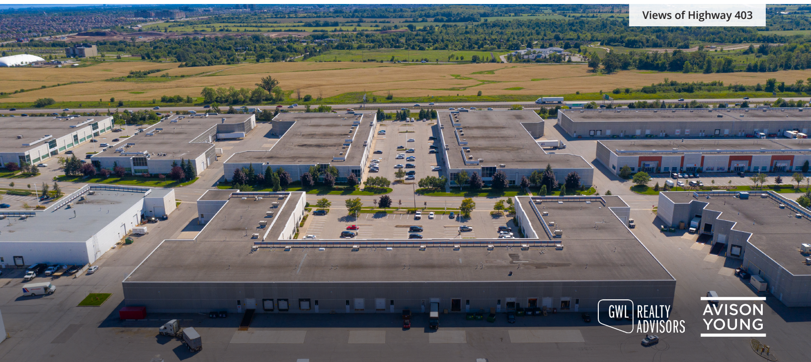
Views of Highway 403