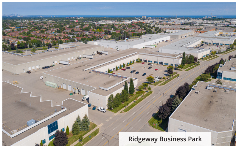
Ridgeway Business Park