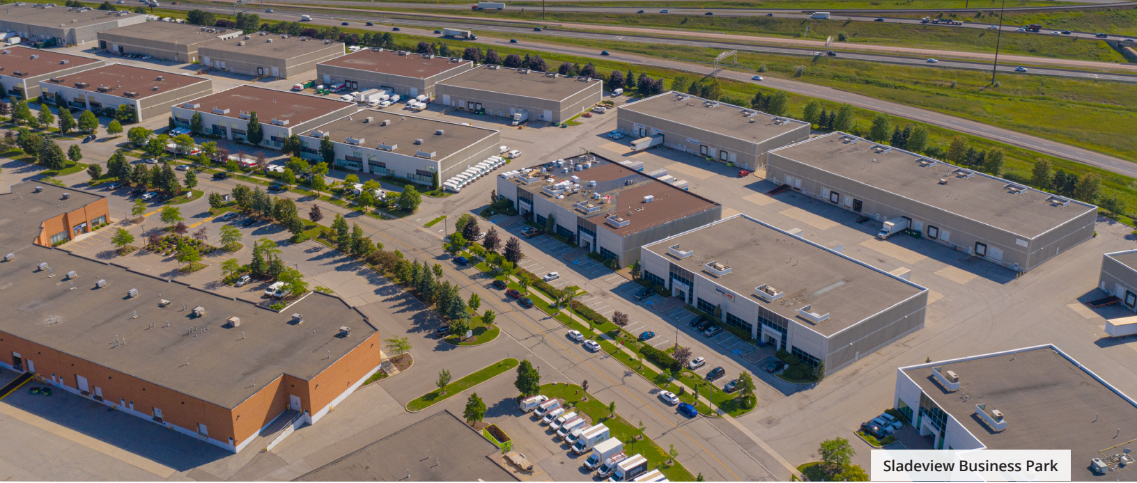
Sladeview Business Park