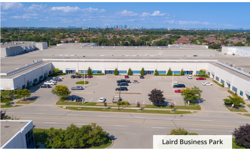
Laird Business Park