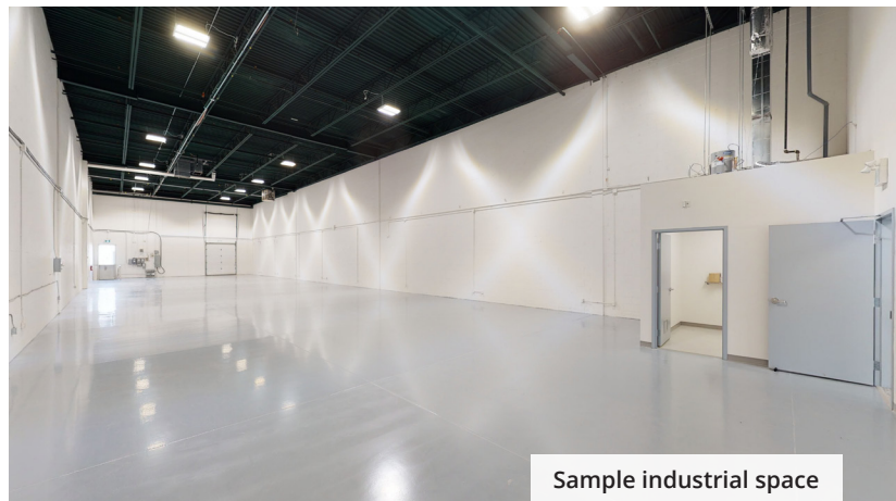
Sample industrial space